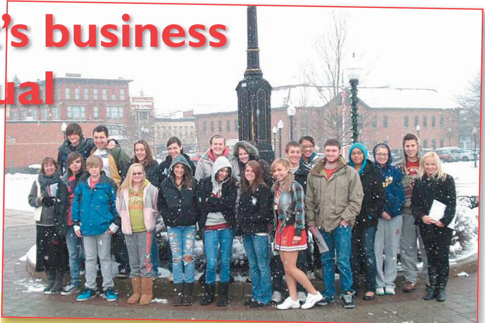
Students are pictured at Jamestown Community College (above) and Jamestown Business College (right).

In addition, some of our students attended Jamestown Community College in Olean to attend the "Career Horizons – 2010".