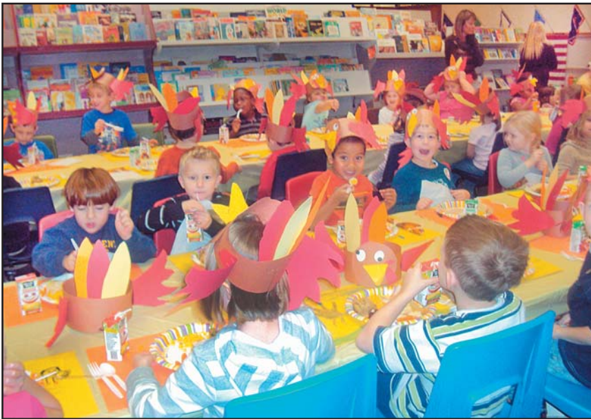
KINDERGARTEN THANKSGIVING FEAST: East View's Kindergarten students enjoyed a traditional Thanksgiving feast (above) together. A special thanks to the parents and staff who donated items for the making of the feast.