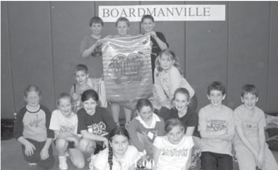
Students and staff at Boardmanville continue to be very busy working and learning new things. After a long, snowy winter, it's nice to see the grass again, and we all look forward to enjoying our wonderful playground. Above, Boardmanville students participated in the Jump Rope For Heart Program, raising $701 for the American Heart Association.