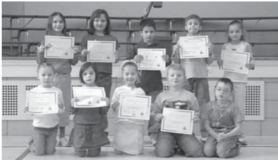
Students in kindergarten through third grade (shown at left) were recognized for displaying the character trait for the month of March, CARING.