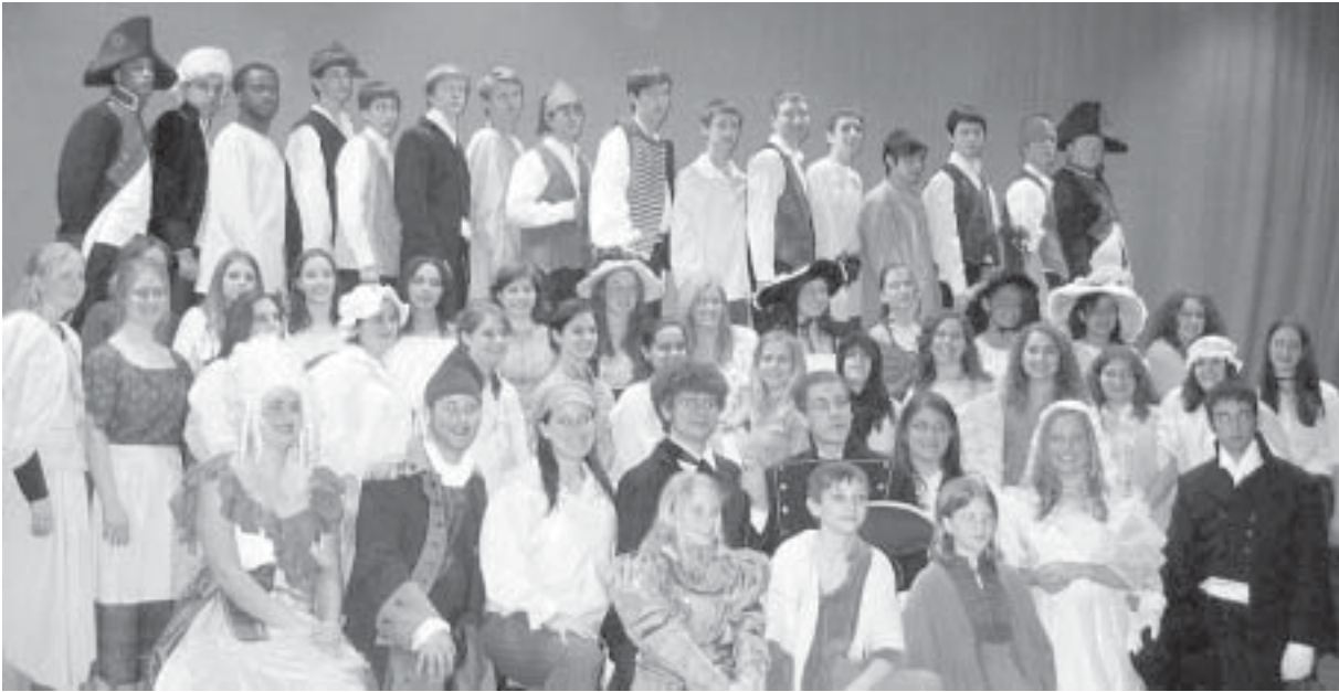
Pictured at left is the cast of the OHS musical "Les Miserables" which delighted audiences April 1 and 2 with outstanding performances from everyone involved.